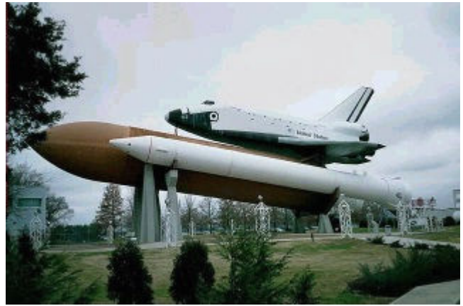
The Space Shuttle on display at the Space Center in Huntsville, Alabama.