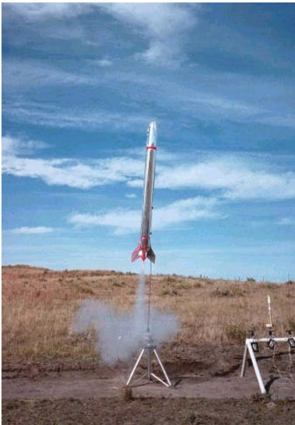
Whoa, Dude, what's up? Eric Meing's Dude takes flight at Cape Preble.